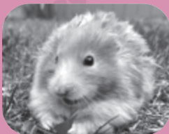
Biscuit, Deer Run