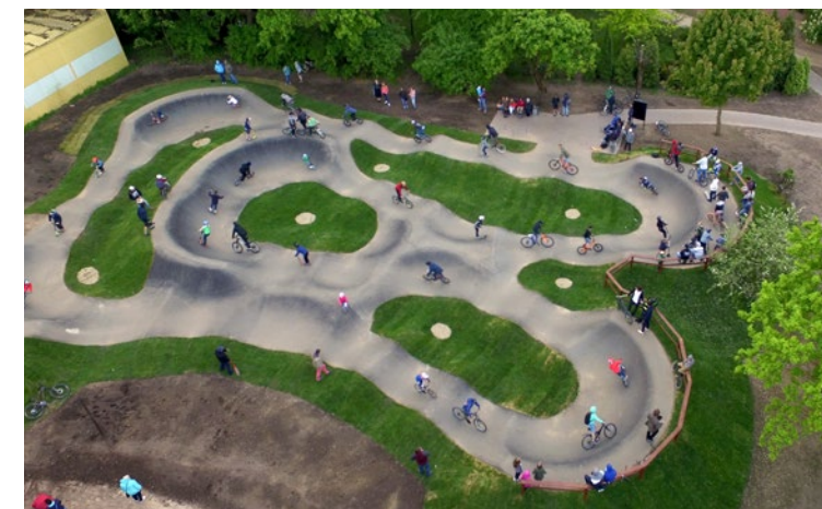
DESIGN INSPIRATION IMAGES